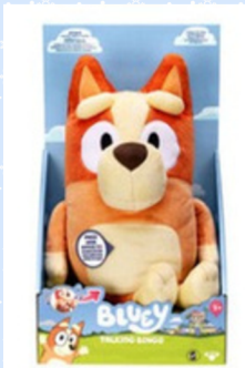
Bluey Themed Toys