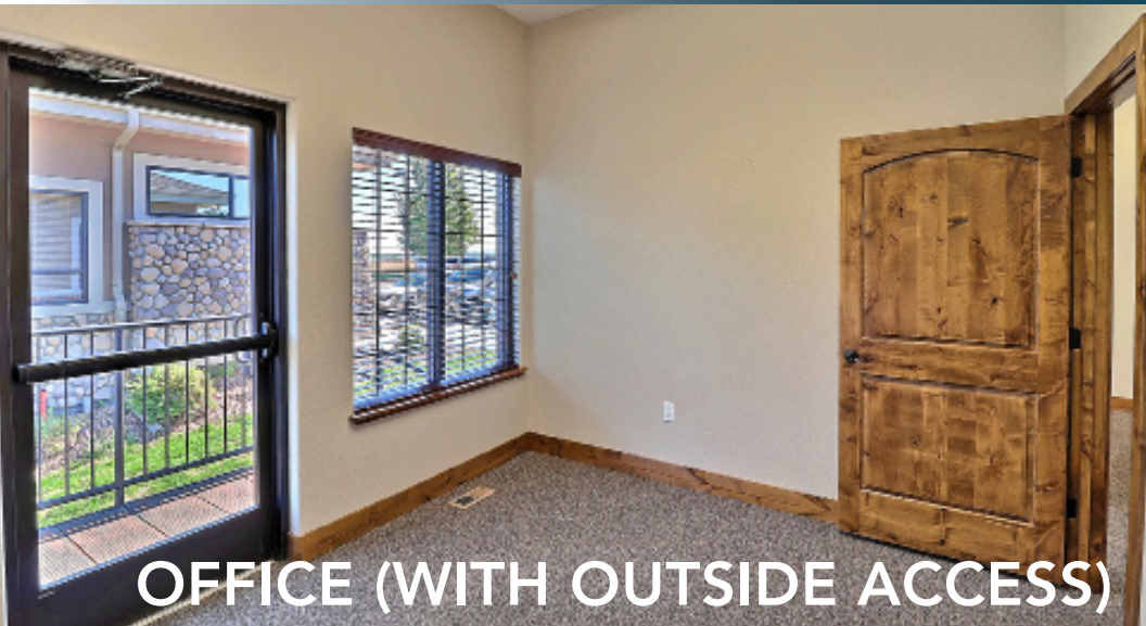
OFFICE (WITH OUTSIDE ACCESS)