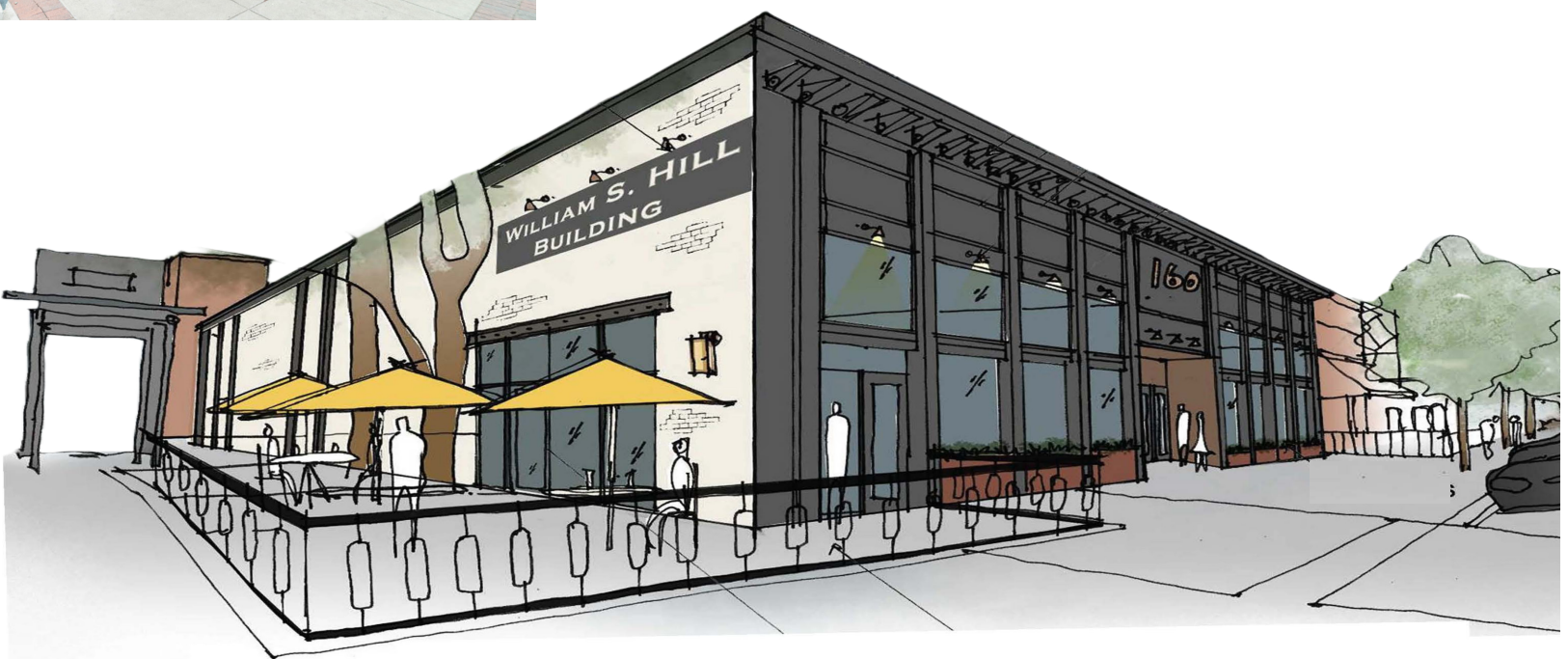
*All plans conceptual and subject to final design and feasbility, including obtaining any required city approvals