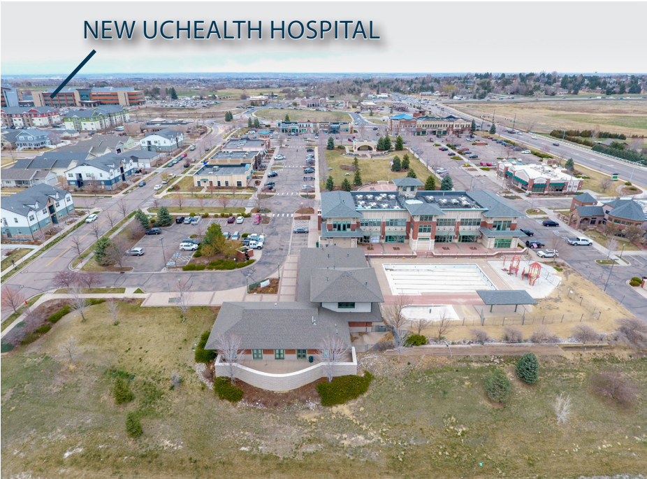
NEW UCHEALTH HOSPITAL