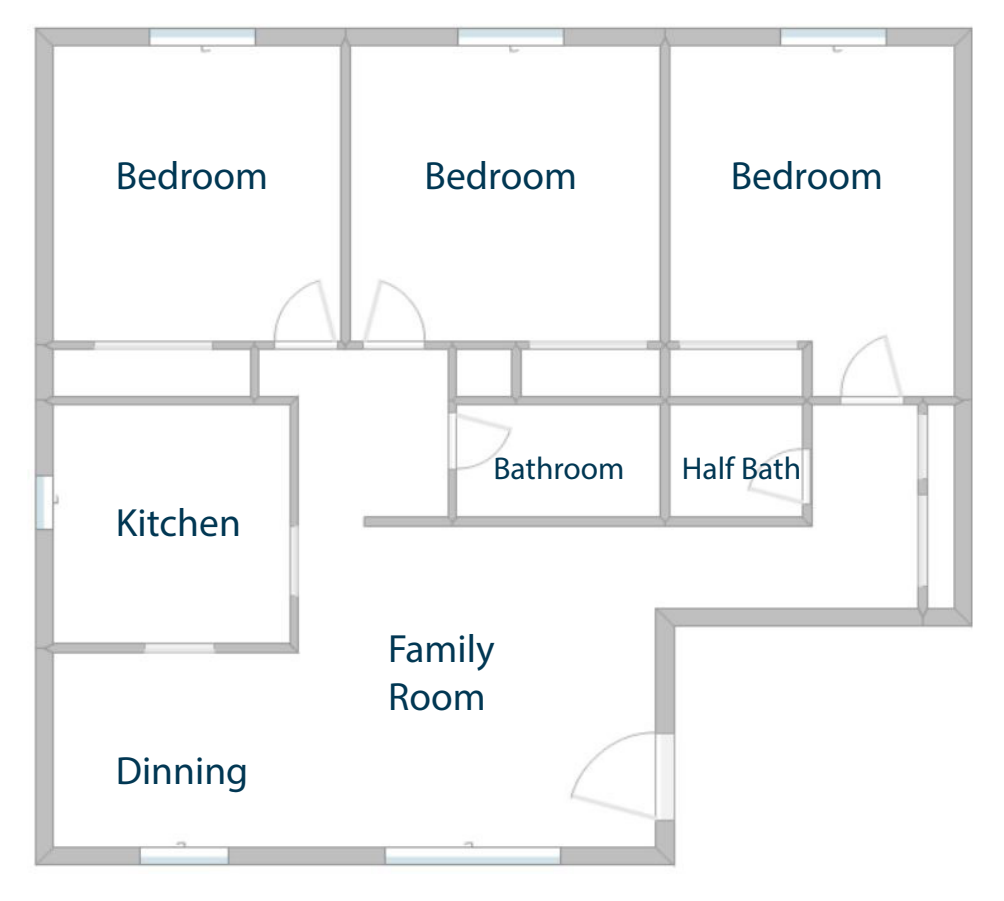
3 BED 1.5 BATH