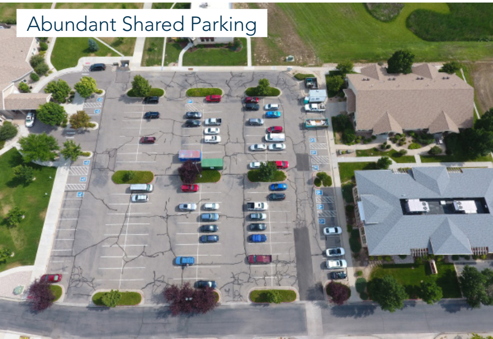
Abundant Shared Parking