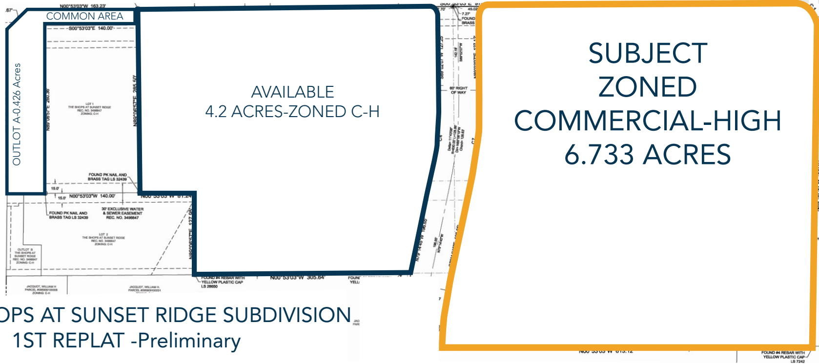
THE SHOPS AT SUNSET RIDGE SUBDIVISION 1ST REPLAT -Preliminary