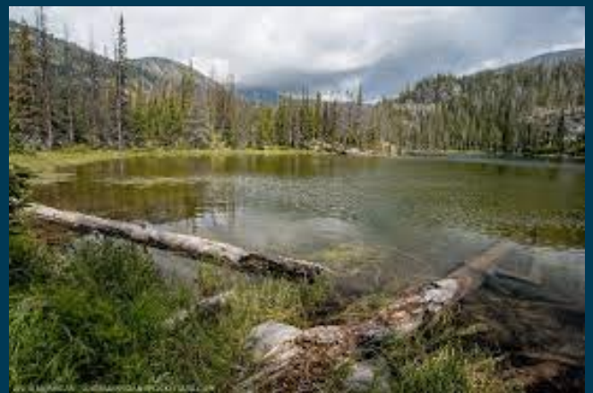
Zirkels/Gold Creek to Gold Lake (moderate)