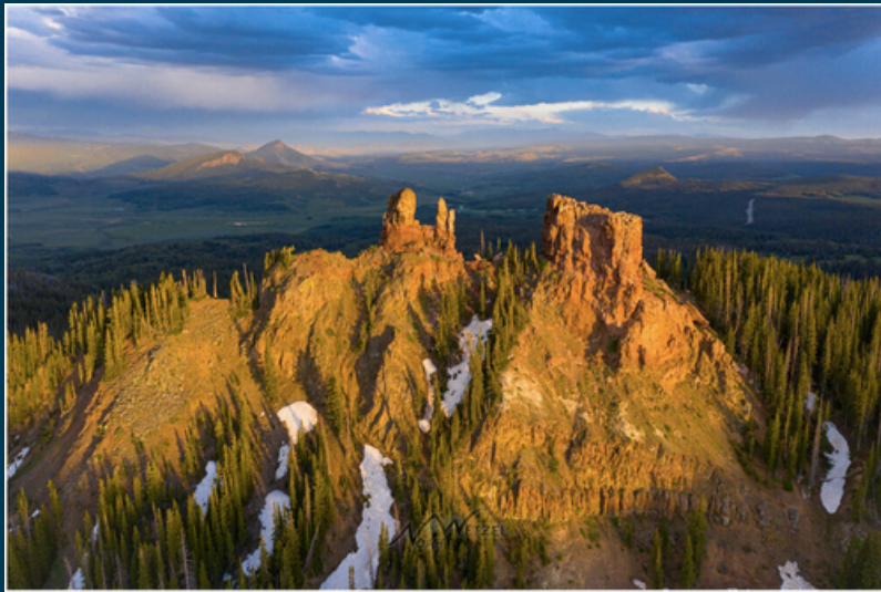
Rabbit Ears Peak (easy)