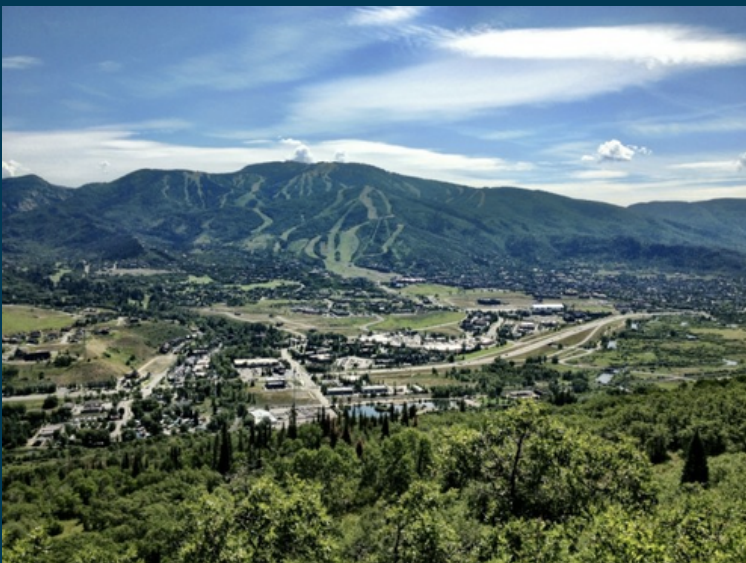
Emerald Mountain (easy/moderate)