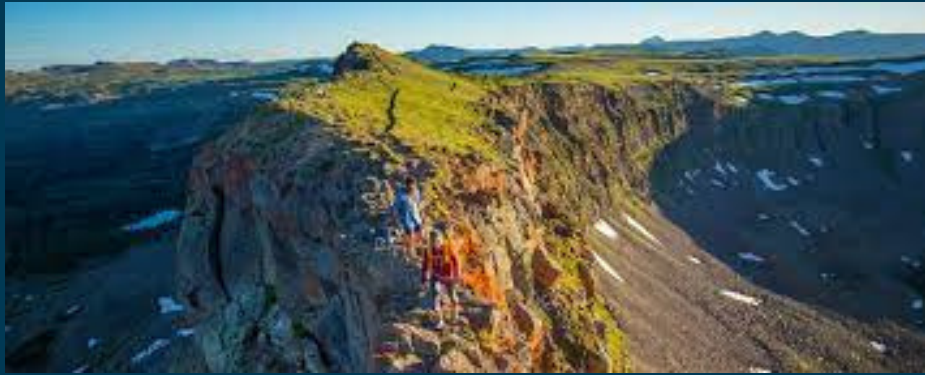
The Flat Tops/Devil's Causeway (moderate)