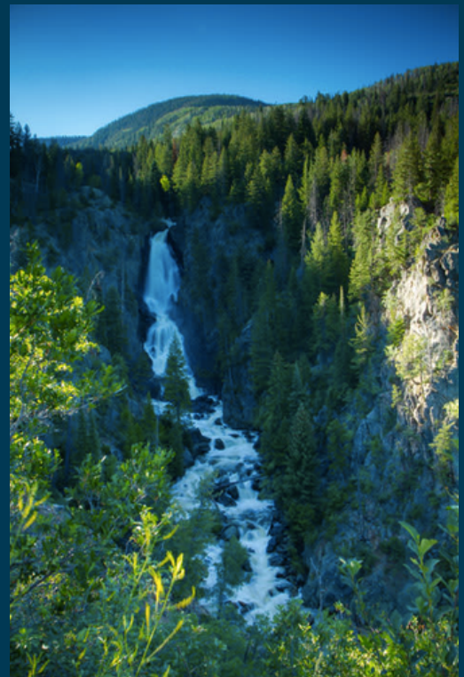
Fish Creek Falls/Long Lake (easy or moderate)