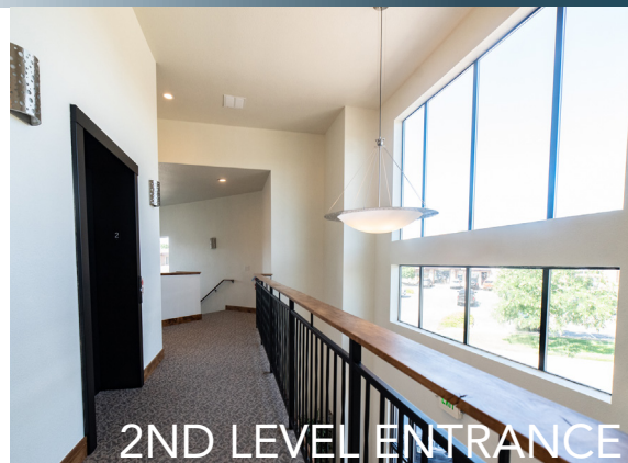
2ND LEVEL ENTRANCE