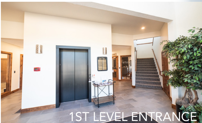
1ST LEVEL ENTRANCE