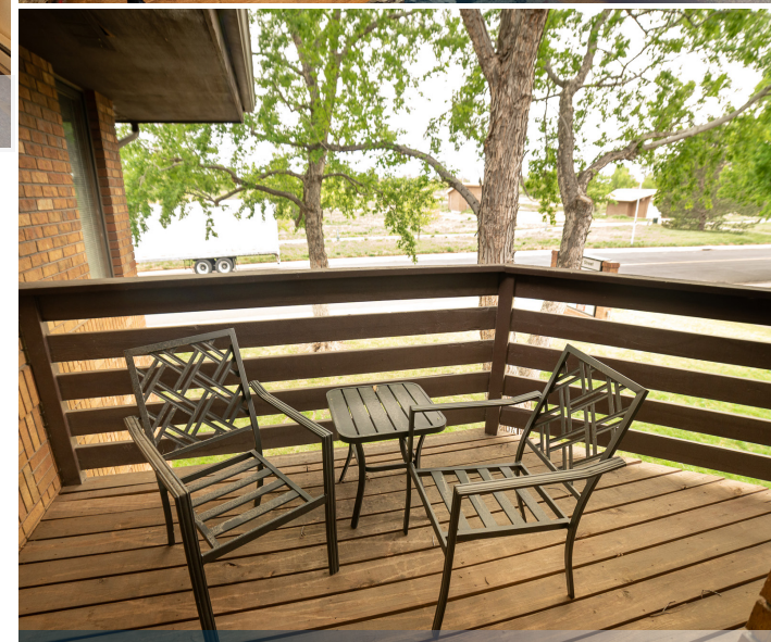
SHARED BALCONY (SUITES C & D)