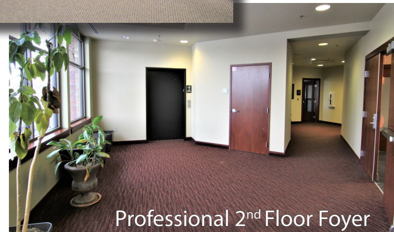
Professional 2 nd Floor Foyer