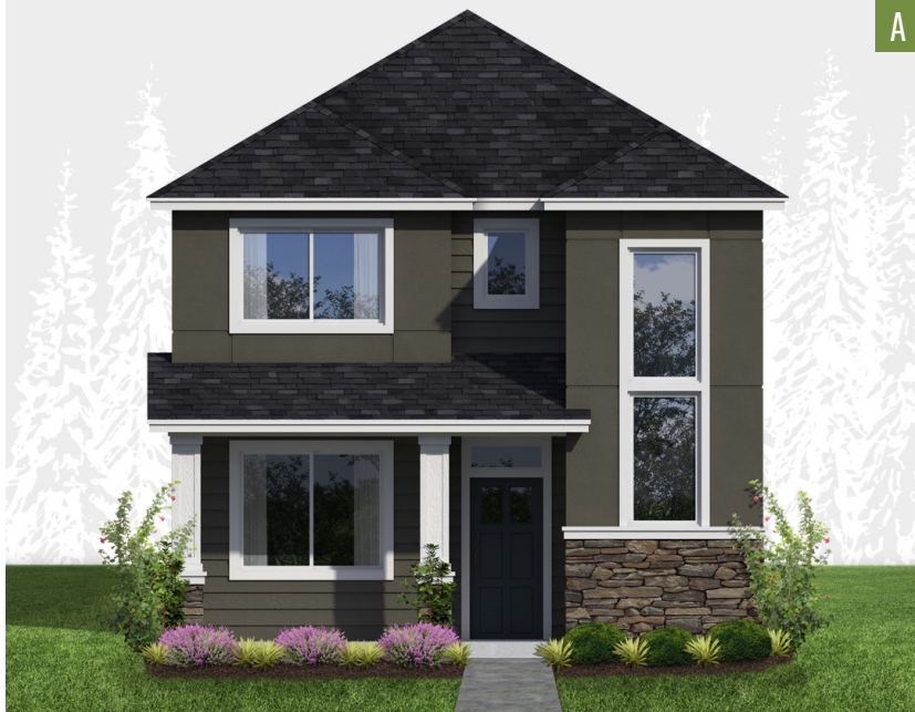
MAIN LEVEL (TOP)