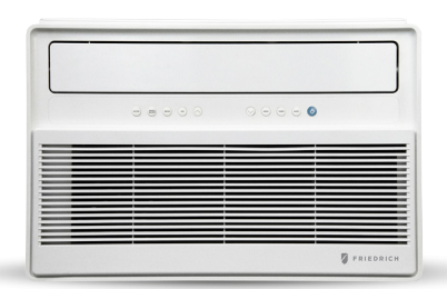
WINDOW OR THRU-WALL INSTALLATION CCV15, CCV18, CCV24