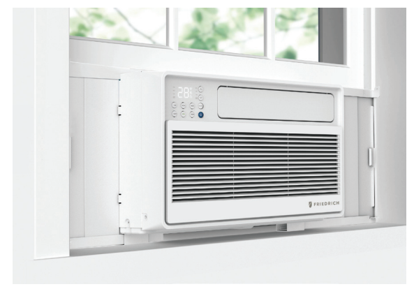
Rigid, Expandable Side Panels