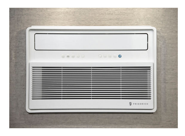
Models CCV15, CCV18, CCV24 can be installed in a wall or window