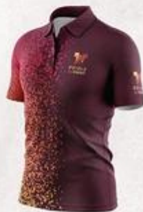
FULL COLOR DYE SUBLIMATION