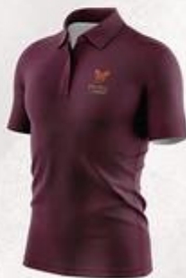
TRADITIONAL DECORATION (SILK SCREEN & EMBROIDERY)

Our line of jackets for management or delivery staff, aprons, towels and accessories such as chair backs and toppers are the perfect complement to create a cohesive look across your entire team.