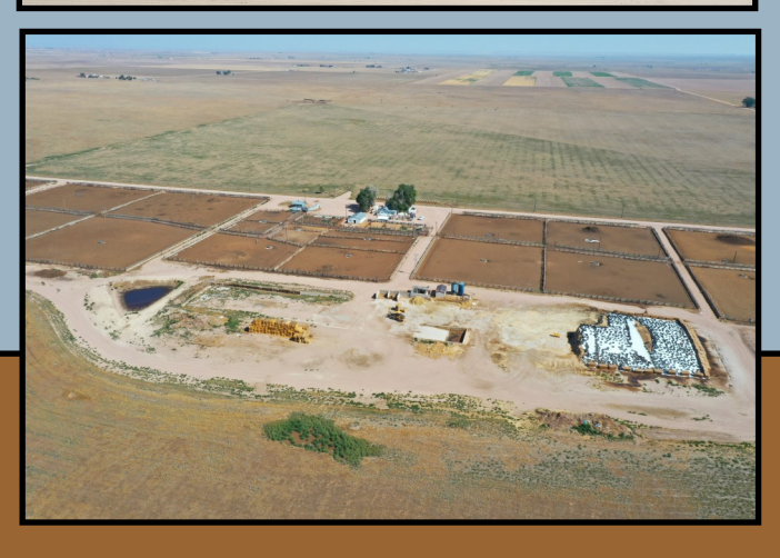
The information contained in this brochure is from reliable sources and is believed to be correct, but is NOT guaranteed.