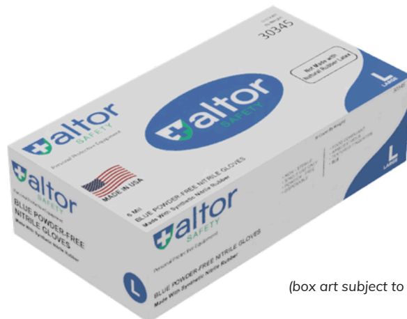
(box art subject to change)