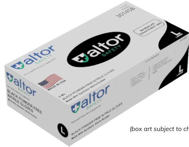
(box art subject to change)