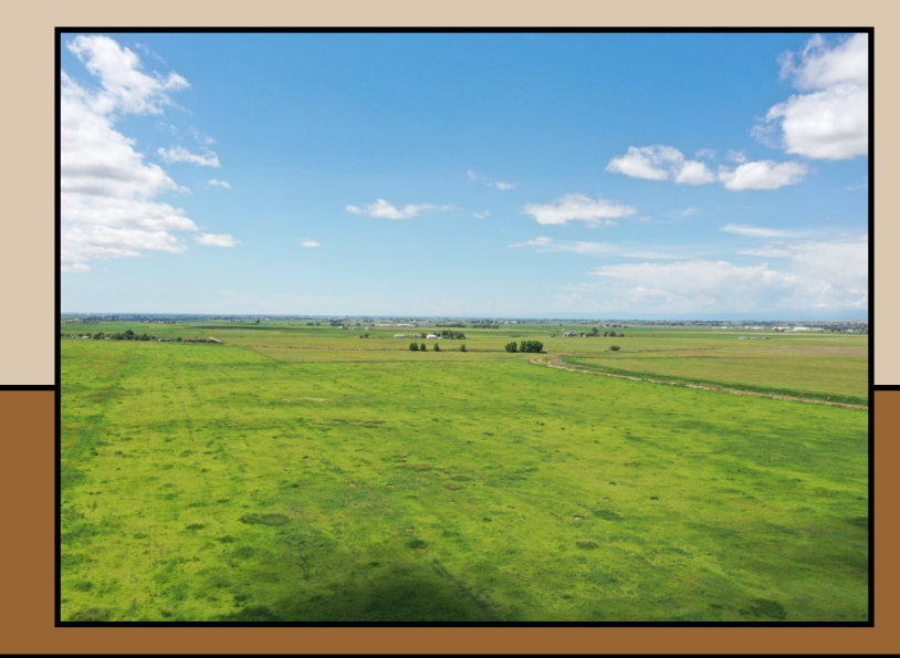
The information contained in this brochure is from reliable sources and is believed to be correct, but is NOT guaranteed.