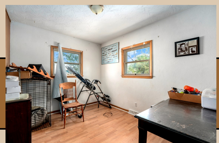
The information contained in this brochure is from reliable sources and is believed to be correct, but is NOT guaranteed.