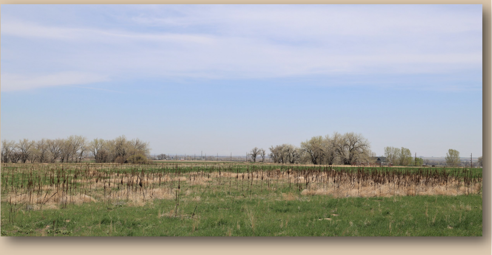
From Hwy 119/I-25 east to County Road 19, access is south of CR 24 approx. 1/3 mile