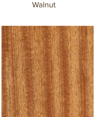
Quarter Sawn Sapele