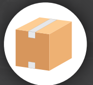
TOP & BOTTOM SEAL

110 VOLTS SINGLE PHASE - 20 AMPS Power Requirements