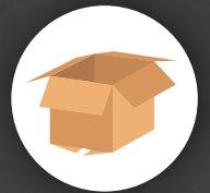
BOTTOM FLAP FOLDER