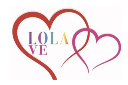
LOLALOVE Activewear Official Brand & Sponsor