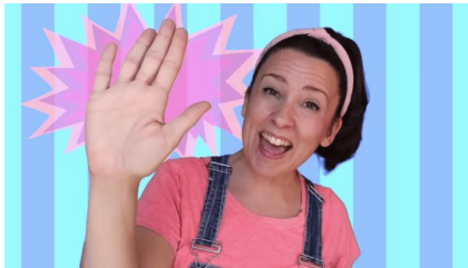
MISS RACHEL-MOMMY & ME DANCE