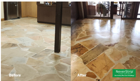
Easier Stone Cleaning