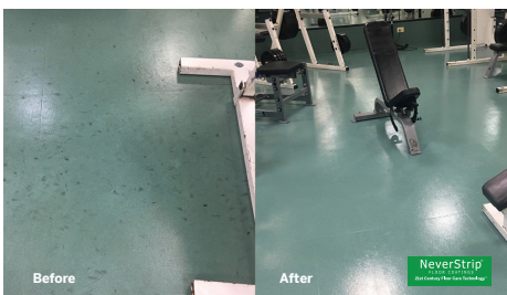
Easier Rubber Cleaning