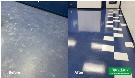
Enriched VCT Colors