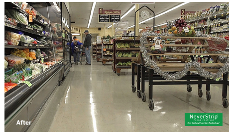
No Stripping, Ever