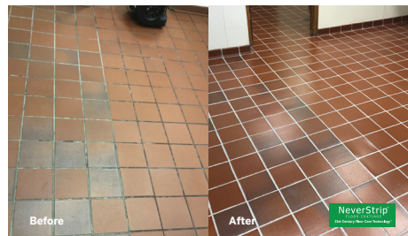
Shine with Traction