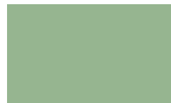
XP - Colonial Green