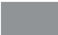
XP - Dark Gray