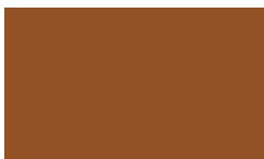
XP - Terra Cotta