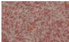
BQ - Cheyenne