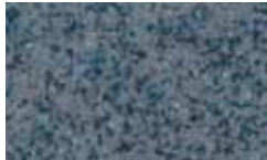
BQ - Storm Cloud