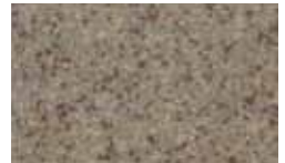
BQ - Camel