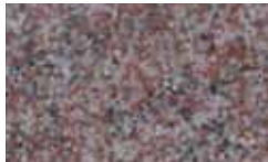
BQ - Reef