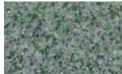
BQ - Sage