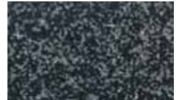
BQ - Sable