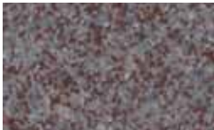
BQ - Quarry