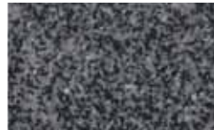
BQ - Timberwolf