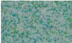
BQ - Mint