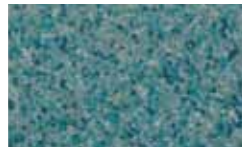
BQ - Ocean Wave

Broadcasted quartz floors have the added benefits of ease of cleaning and outstanding coefficient of friction for wet environments.