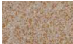
BQ - Incan Gold