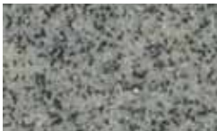
BQ - Slate