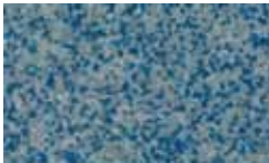
BQ - Oceana

These durable and attractive systems are ideal for the harshest most demanding environments including: food plants, kitchens, restrooms, auto repair shops, chemical facilities, locker rooms, etc.