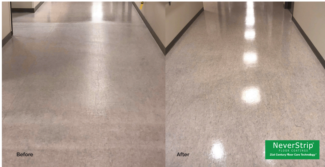
The After picture shows the Micron Sealer burnished. A satin finish is the result with no burnishing.