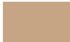
HSU - Light Tan