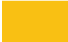
HSU - Safety Yellow

This color chart is an approximate color guide only. Actual colors will vary under different lighting conditions. Colors should be verified in a small area prior to application. NeverStrip recommends multiple containers of colors are blended together to insure color consistency across a project. Custom Colors are available in minimum quantities of 30 gallons.