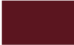
HSU - Brick Red