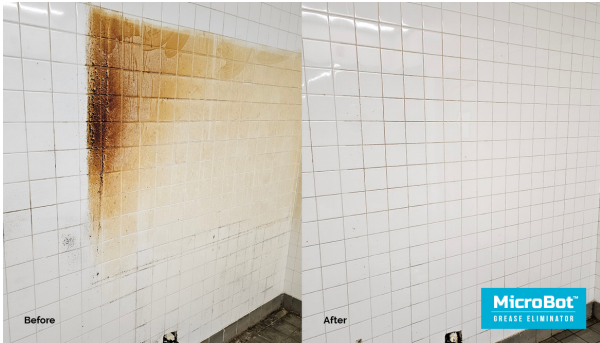
Oil Removal on Tile & Grout Wall