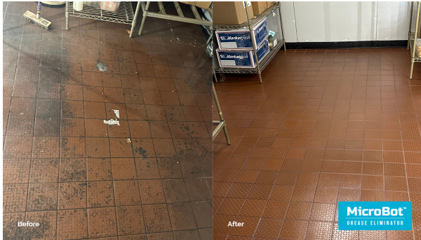
Commercial Kitchen Cleaning