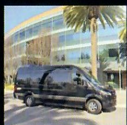
14 PAX Sprinters