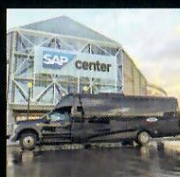
Mini & Full Coach Buses