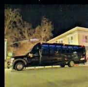
( Party Limousine Buses )