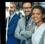
Airport Transfers (Corp & Employee Transportation)