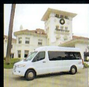
( 14 PAX Sprinter Limousines )