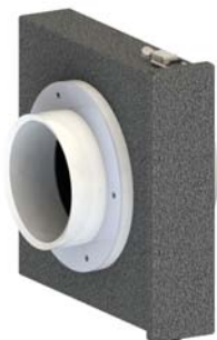
SAGE-EFK-TT-SV EFK Pass Through Filter Housing