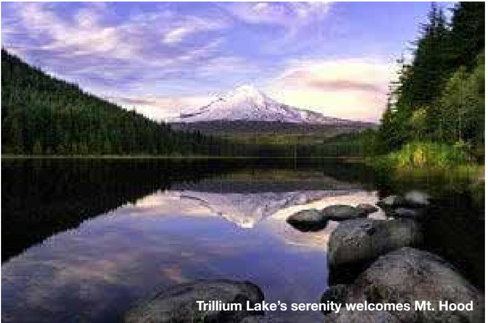
Trillium Lake's serenity welcomes Mt. Hood