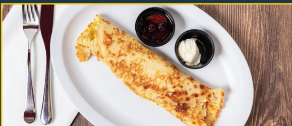
EGG & PARATHA CREPE