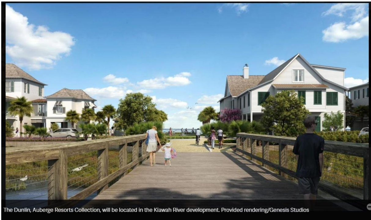
The Dunlin, Auberge Resorts Collection, will be located in the Kiawah River development. Provided rendering/Genesis Studios

A variety of outdoor activities will be offered, including fly fishing, crabbing and boating excursions. Guests will also be able to walk nature trails and visit the community’s working farm.