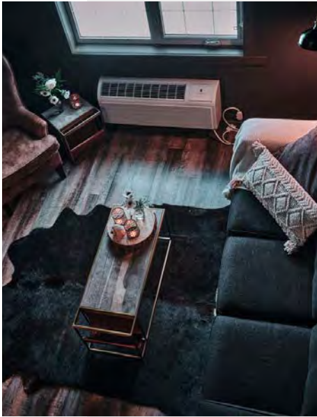
King Lofts for 2 - 4 adults

Need a place to get ready, relax, party then crash? We have you covered! We have 12 beautifully decorated rooms here at the Villa that can accommodate up to 48 guests.