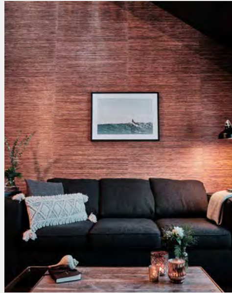
Queen Lofts for 2 - 4 adults