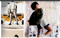
THE MOST INSPIRING STORIES IN DALLAS