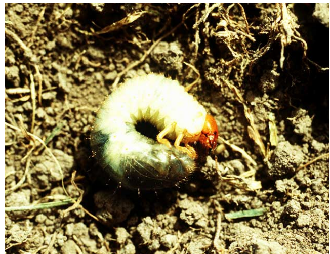
Figure 1. Third-instar (mature) grub.

Adults emerge from the soil June through early August. The adults emerge at about dusk and swarms of males fly low over the turf in search of females. Eggs usually are laid in the top 2 inches of soil. The developing grubs will reach the final instar (third) in late summer and early fall. Most damage to turf is done in September and early October when the grubs are full-