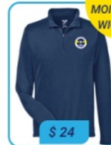
GLA Quarter Zip Long Sleeve Shirt