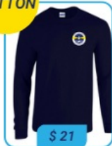
GLA Long Sleeve T-shirt