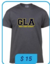
GLA Flagship T-shirt