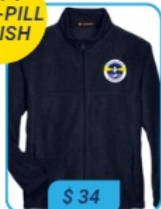
GLA Fleece Jacket