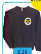
GLA Crewneck Sweatshirt